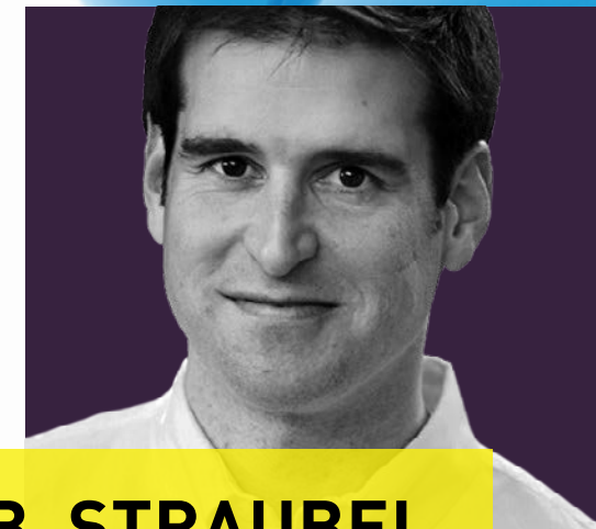
J.B. STRAUBEL TESLA MOTORS