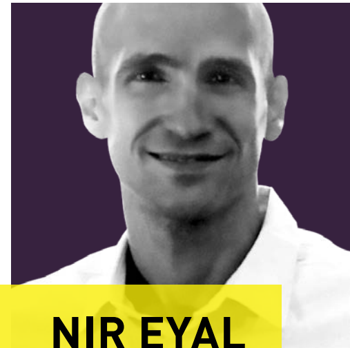
NIR EYAL FORBES